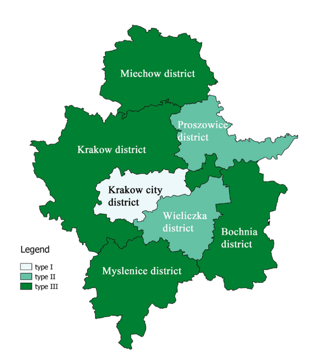
Figure 4. Classification of KOM districts by means of the Thorndike's method according to types

Evaluation performed on the basis of the presented above analysis clearly indicates that among districts of Krakow Metropolitan Area Proszowice and Wieliczka districts are the ones with the worst preserved environmental order. The average rating is received by Krakow city. Balance in the range of environmental order is maintained in Bochnia, Krakow, Miechow and Myslenice districts. On that basis it can be concluded that Krakow authorities try to carry out actions to protect and improve natural environment's state. Despite socio-economical character of the city which is the centre of described agglomeration, environmental issues are taken into account here. Lack of wild waste sites, significant expenses at air protection as well as green lands percentage in the total city area can be definitely regarded as positive aspects. However, taking air pollution or carbon dioxide emission from especially burdensome companies into account, it seems necessary to introduce actions aimed at these factors values' improvement. The worst situation is in Proszowice and Wieliczka districts. In contrast to Krakow