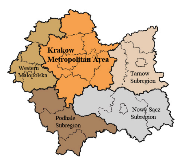
Figure 1. Krakow Metropolitan Area against the background of Malopolska Province partition to functional subregions [on the basis of Subregional Development Programme to 2020 (Project)]

Districts that are part of Krakow Metropolitan Area including one municipal district: Krakow city and also 6 land districts: Bochnia, Krakow, Miechow, Myslenice, Proszowice and Wieliczka were the subject matter of researches (Fig. 1). KOM is one of 5 Malopolska Province subregions. Legal basis for creating that subregion was the Act from 27th March 2003 on Spatial Planning and Development. This Act defines the metropolitan area as: "an area of a big city and direct surroundings functionally connected with it, appointed in spatial conception of country development". Creating KOM was aimed at maintaining and growth of this area competitiveness and in consequence also Malopolska Province against a backdrop of the country and in the international arena [Sowa M. 2007]. As districts union, KOD was intended for tasks in the range concerning among others growth and spatial development, undertakings of infrastructural character, limiting of spatial and economic conflicts, as well as monitoring changes that take place in this area in spatial, social, economic and business aspects. At first, being guided by criteria such as commuting, population density or initiative level, KOM borders included 51 communes situated in 8 districts. Current delimitation was performed to establish Malopolska Province Development Strategy for 2011-2020 involving 7 districts